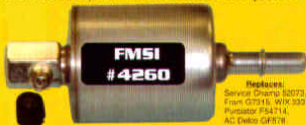
Fuel Filter with Pump Pressure Test Valve.

Allows Technician to check fuel pump pressure and clean fuel injectors on vehicles with hard-to-reach, or non-existent service ports.