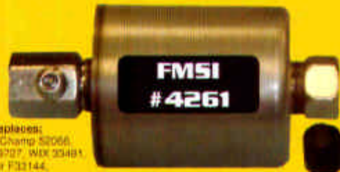
Fuel Filter with Pump Pressure Test Valve.

Replaces: Service Champ 52073, Fram G3715, WIX 33311, Purpator F54714, AC Delco GF878