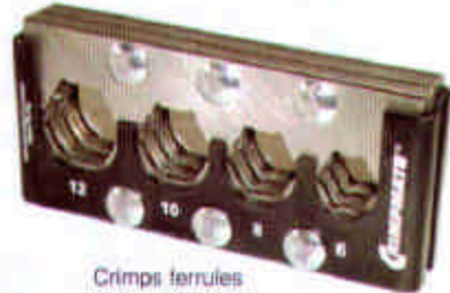
Crimps ferrules using shop vice.