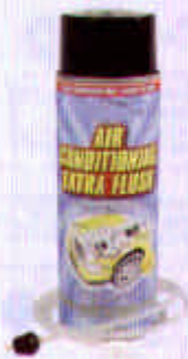
FMSI Flush Solvent Quick Dry Ultra Fast System Flush 20.5oz. Aerosol FMSI #AR8201 (12 Pack) FMSI #AR8201-3 (3 Pack)