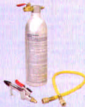
Flush Gun Quick and Easy Way to Flush Condensers, Evaporators, Hoses etc. FMSI #AR6223